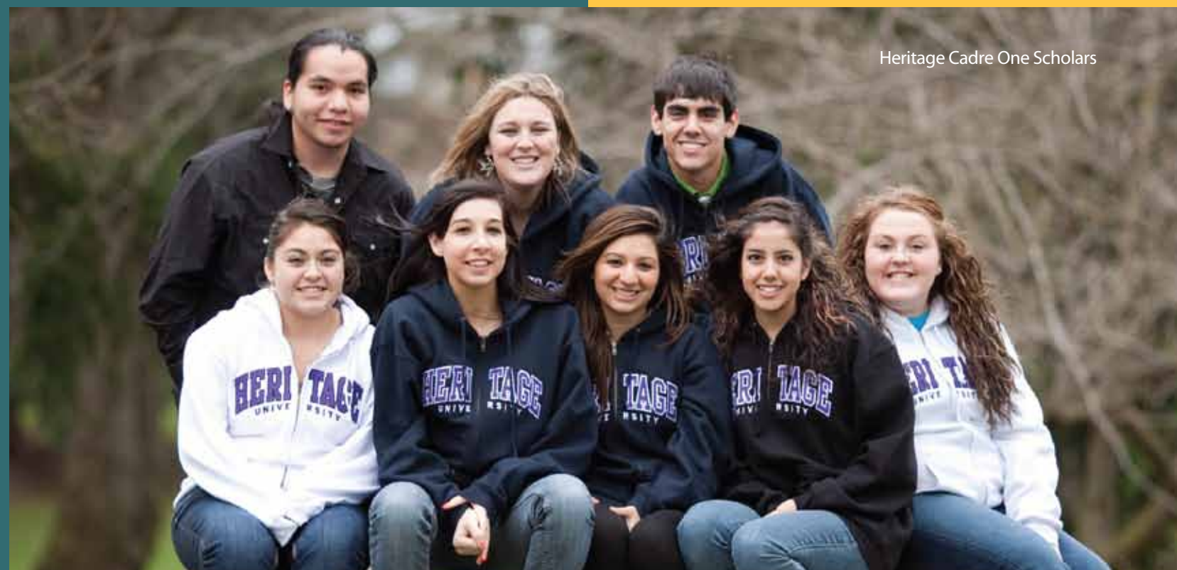
Heritage Cadre One Scholars

Learn more and start your online application today at www.actsix.org